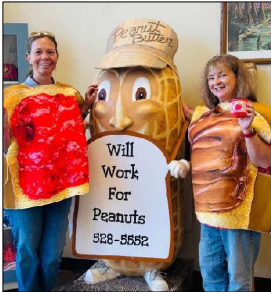
Peanut Butter & Jelly Drive