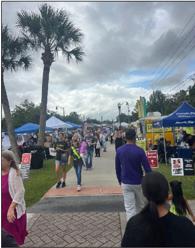
Central Florida Peanut Festival